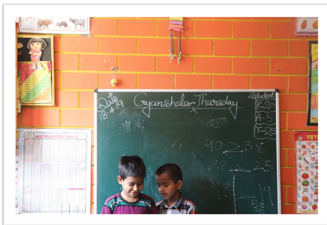
Gyan Shala Classes, Farrukhabad, 2019