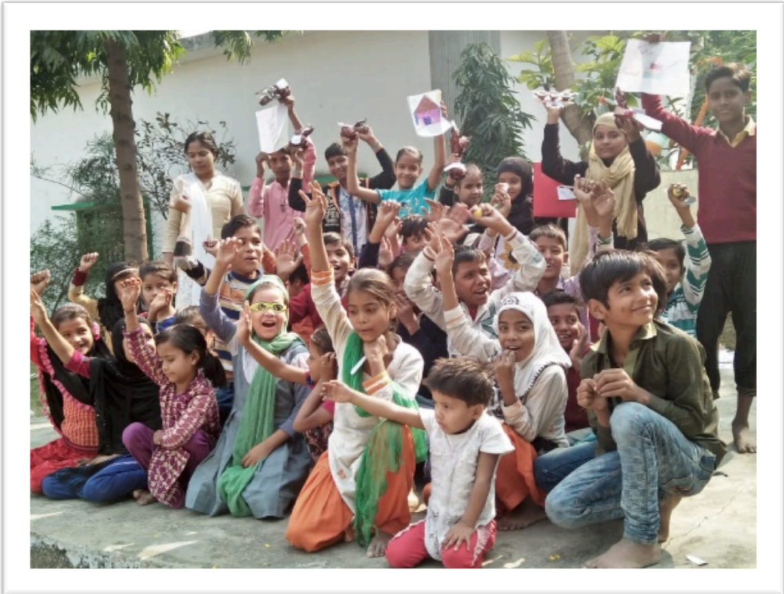
Children showcase their art in UP.