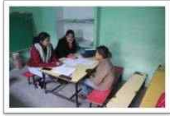
E&H staff with field team (left) & our team of interns taking student interviews (right) in Farrukhabad, January 2020