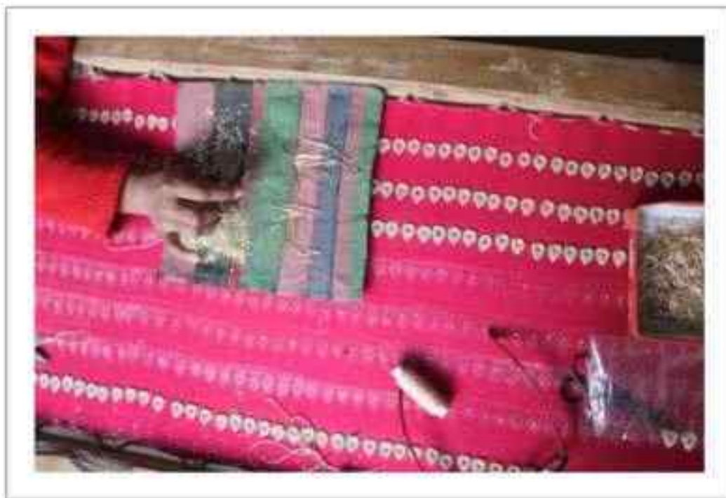
One of the parents doing 'Zardozi' work at her residence in Farrukhabad

time to supplement family income, mostly indoors due to societal restrictions. Detailed profile of these communities is mentioned in Tables Annex 1A, 1B, 2A & 2B at the end of this report.